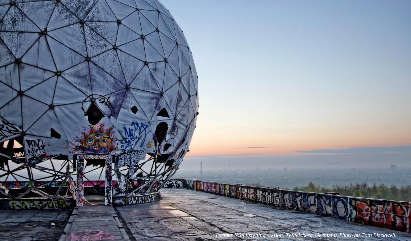
Former NSA listening station, Teufelsberg, Germany.